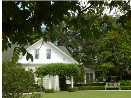
Historic Palm Cottage from The Norris Gardens

The scale of buildings is a critical factor in preserving the character and charm of a community. The Society's actions will ensure that the scale surrounding the Cottage will forever be appropriate.