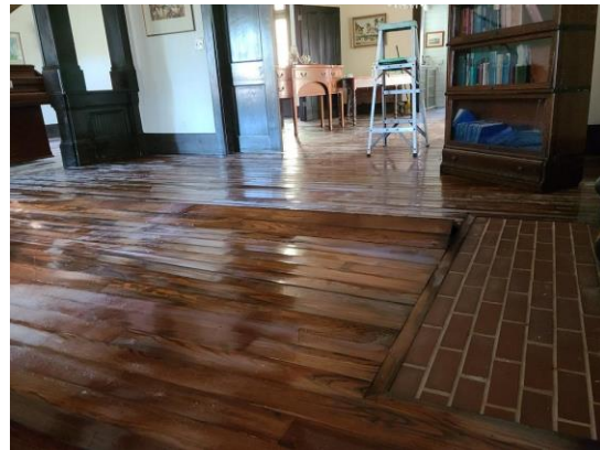
Buckling floors throughout the 1st floor of Historic Palm Cottage.

Historic Palm Cottage™ suffered the most damage and is our chief priority. Every plank of the Dade County Pine flooring will be removed, cleaned, repaired, treated, restored and replaced (first floor only). That is the goal, but because there are some planks that will not make it, we have a "salvage" plan in place. The gorgeous baseboards, drywall and some column finishes have a great deal of moisture. Our general contractor has a plan to address this. The tabby mortar walls have moisture too, but luckily this will not evolve into mold because tabby material is not "food" for mold. Of course, we will address the water tabby water-wicking issue as well. The good news is that the A/C is working again!