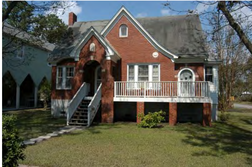
Frame building elevated on concrete block foundation faced with brick veneer. Belhaven, North Carolina.

With assistance from the North Carolina State Historic Preservation Officer, plans were developed for an elevation project that would best preserve the historic character of the district. In the plan, frame buildings were raised onto concrete block foundations faced with brick veneer. Brick buildings were elevated onto