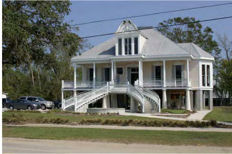
Elevation of a historic residence in Mandeville, Louisiana

Essentially, the steps required for elevating a building are largely the same in all cases. A cradle of steel beams is inserted under the structure; jacks are used to raise both the beams and structure to the desired height; a new elevated foundation for the house is constructed; and the structure is then lowered back onto the new foundation and reconnected. At a minimum, the foundation