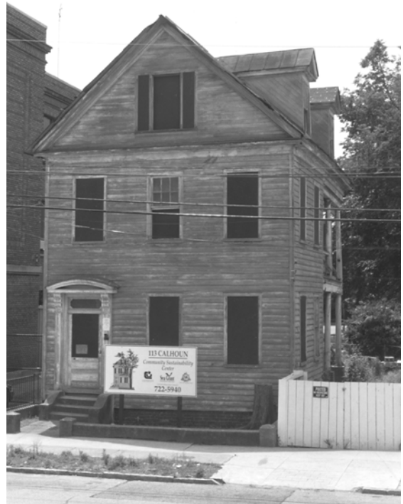
113 Calhoun at inception of project