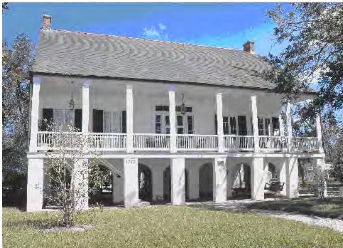
Elevation of a historic residence in Mandeville, Louisiana

While elevating a structure above the BFE will provide the structure the most protection, a less intrusive elevation may be desired or more feasible for a historic structure. Other protection measures, such as elevating utilities and equipment above the BFE, should be considered if elevating a historic structure to the BFE is not practicable.