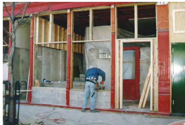
Floodproofing the vestibule of a storefront

The successful integration of historic preservation and hazard mitigation earned Darlington a Preservation Achievement Award from the State Historical Society of Wisconsin.