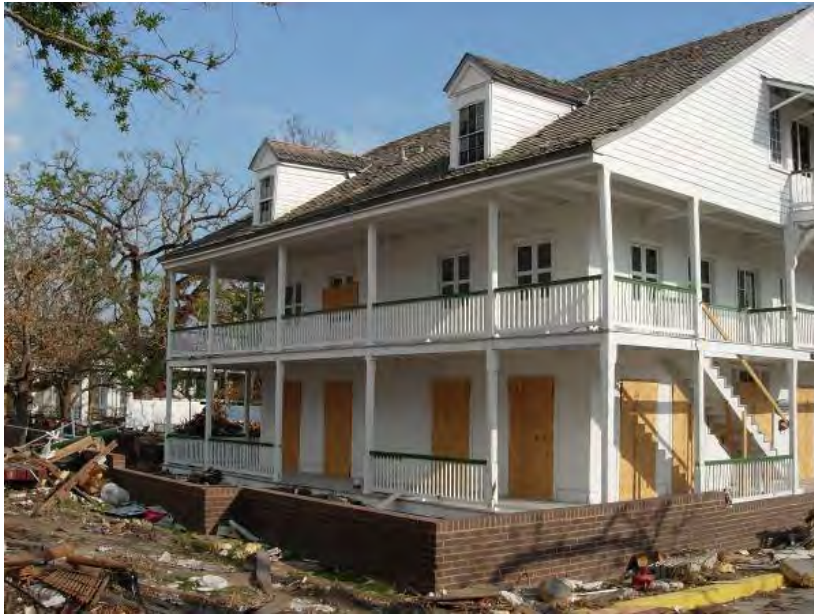
Built by John Holm in 1847, the Magnolia Hotel, badly damaged from Hurricane Camille in 1969, was moved 100 yards north and restored by the City of Biloxi in 1972. As a result, the hotel experienced only minimal flooding during Hurricane Katrina.

Relocation is the mitigation measure that can offer the greatest security from future flooding. Relocation involves moving the entire structure out of the floodplain or it may involve dismantling a structure and rebuilding it elsewhere. It may be possible to relocate a building to a higher part of the same parcel or lot, but often it will be necessary to move the building to another site. In either case, it is the most reliable of all mitigation measures. In addition to relieving the property owner from future anxiety about flooding, this method can offer the opportunity to significantly reduce or