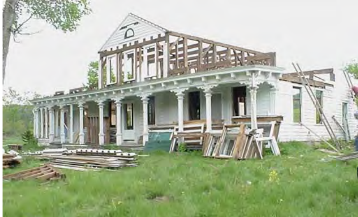
Dismantling of Bruchmann residence, May 2000

Relocation in Fulton, New York. On January 19, 1996, floodwaters of the Schoharie Creek rose nearly 18 feet damaging many properties in the Town of Fulton, in Schoharie County, New York. The Town of Fulton submitted a Hazard Mitigation Grant Program application to FEMA for the acquisition and demolition of 12 properties. In reviewing the Town of Fulton’s application, FEMA initiated consultation under section 106 of the National Historic Preservation Act. As a result, FEMA determined and the New York State Historic Preservation Officer concurred that one of the buildings in the application – known as the “Bruchmann residence” – was eligible for inclusion on the National Register of Historic Places and that its demolition would result in an “adverse effect.” The residence is significant as a notable and substantially intact example of a mid-19th century vernacular design and construction.