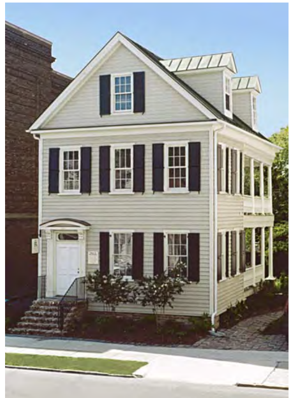
113 Calhoun today