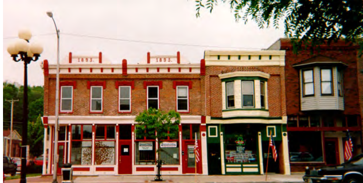
Restored and retrofitted buildings in Downtown Darlington, Wisconsin

Floodproofing in Wisconsin. Flooding is an ongoing part of life in the rural riverside town of Darlington, Wisconsin, having caused millions of dollars in property damage over the past decade. Following the devastating damage from the 1993 floods, the town could follow one of the three routes: do nothing and continue to suffer the periodic floods; move the central business district out of the floodplain and upset the local economy and sense of community; or do something innovative.